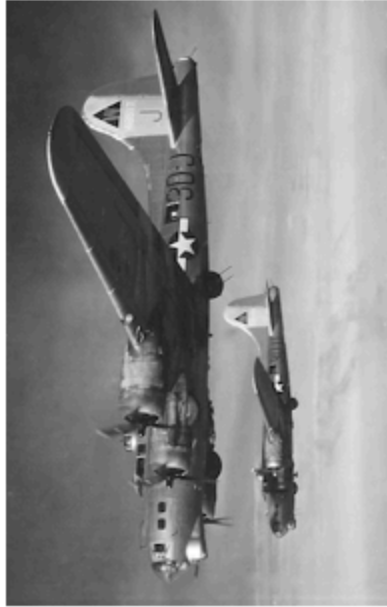
398TH BOMBARDMENT GROUP B-17S