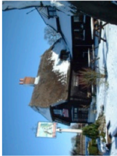
THE WOODMAN INN